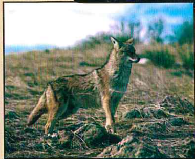
Rural homesites, such as those pictured above, provide "fast food" for the coyote. Garbage, pet food, and even pets are a quick, easy meal.